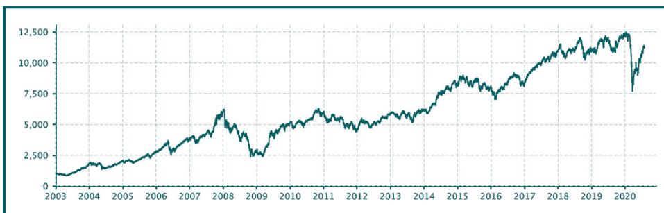
Figure 1 Performance of Nifty 100

Figure 1 depicts the financial performance of the Nifty 100 Index over a 17-year period from 2003 to 2019. It can be observed that the period from 2003 to 2008 saw a steady increase in the value of the index. However, there was a sharp decline from 2008 to 2009. This drop is attributed to the spillover effects of the global financial crisis. Notably, the index rebounded sharply in mid-2009 and thereafter, rose at a gradual and steady rate until 2011. The effect of the European debt crisis led to a slight fall in the index from 2011 to 2012. Thereafter, the index rebounded again from 2012 and witnessed a gradual rise until early 2015. However, as the year 2015 progressed into 2016, the index experienced a significant decline in its value. Then, the period from 2016 to 2019 witnessed a persistent rise that was characterised by price fluctuations. It is also noteworthy that the sudden and sharp fall of